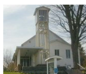
Trinity Anglican Church 746-5221